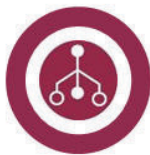
Intelligent Predictive Analytics